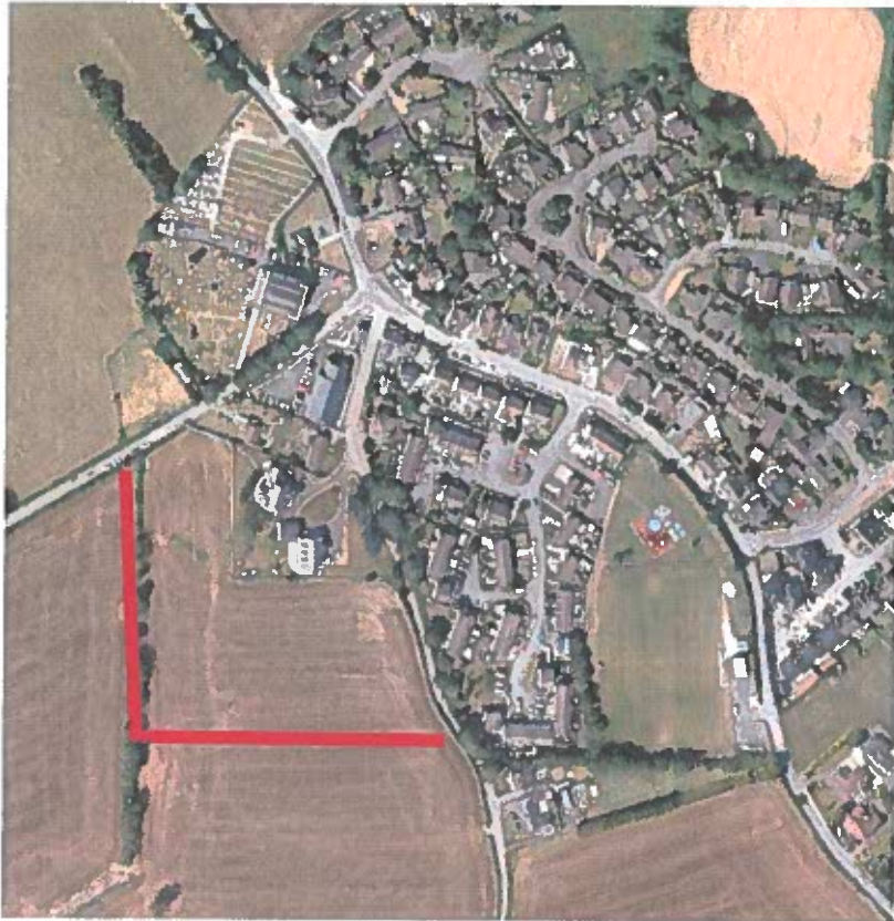
Drumbo – Potential Growth Location – lands already approved for two houses.